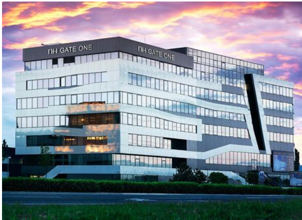
NH Gate One **** Location: Airport

Hotel rates are greatly fluctuating during the year therefore we have fixed rates during the whole year with our contracted partners to guarantee you the best prices. We shall gladly arrange hotel reservation on your behalf downtown or in the vicinity of the airport. We are happy to include the costs from our contracted hotels in your invoice.