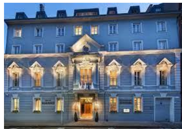
Marrol's Boutique **** Location: Downtown