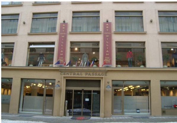
Art Hotel William**** Location: Downtown