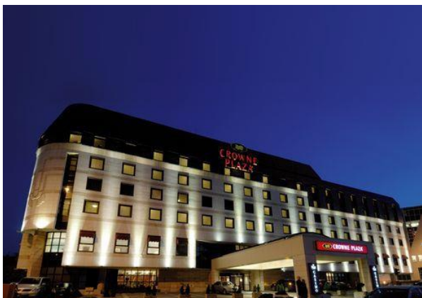
Crowne Plaza **** Location: Downtown