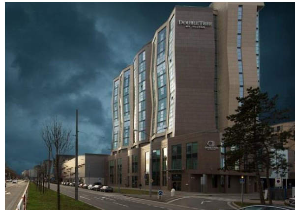
Double Tree ***** Location: Airport/Downtown