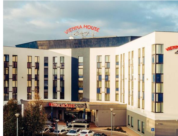
Vienna House Easy *** Location: Airport